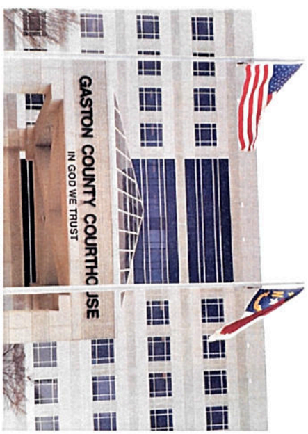
Approved on 2/10/2015

The U.S. Motto Action Committee actively encourages local elected officials across NC and our nation to display the National Motto. Our purpose is to promote America's Christian heritage with the hope that hearts would turn back to Him. II Chronicles 7:14