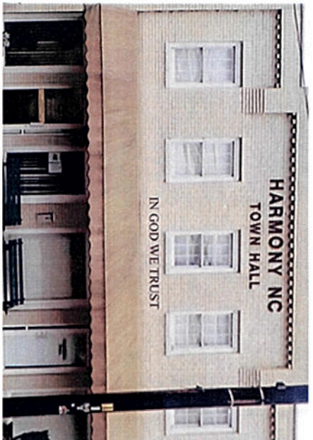
Approved on 3/02/2015

"If we ever forget that we are One Nation Under God, then we will be one nation gone under." Ronald Reagan